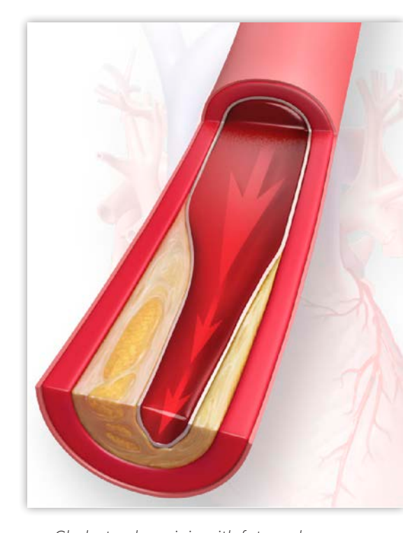
Cholesterol can join with fats and other substances in your blood to build up in the inner walls of your arteries. The arteries can become clogged and narrow, and blood flow is reduced.

Triglycerides are the most common type of fat in your body. They come from food, and your body also makes them. They also can build up within your artery walls and cause plaque.