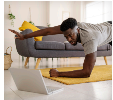
Find your fierce during TV time.