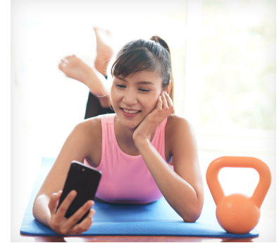
Find your fierce on a conference call.