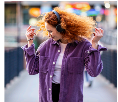
Find your fierce on your way.