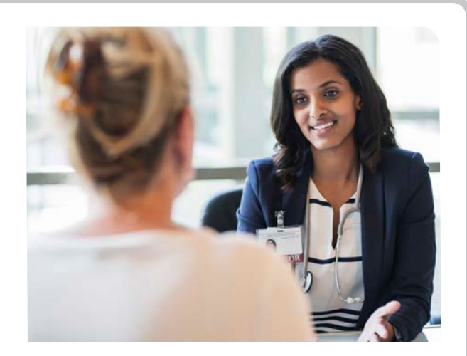
Check with your health care professional before resuming sexual activities.

• Talk to your health care professional about a safe schedule for returning to work.