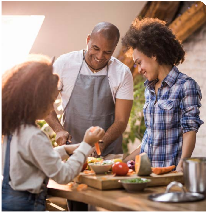
Improving your diet is one of the the many things you can do to improve your heart health.